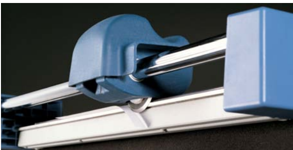
Special sharpened carbon steel blade to cut high thickness of paper